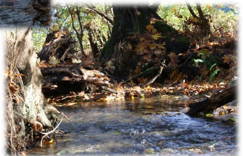
Photo taken November 01 2009 Note the pools and “Calming areas” that the roots created.

It shows and demonstrates exactly what the club was trying to achieve with the placement of the tree root structure. Photo taken November 01 2009