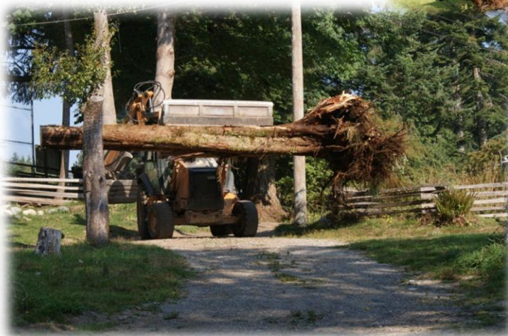
It was a tight squeeze to transport the trees around the old Union Steamship cabins. Photo taken August 2009.