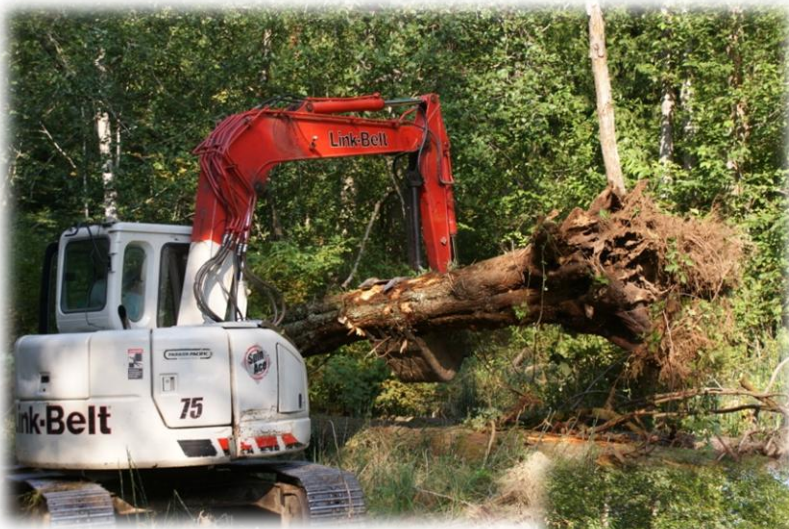
Windfalls were removed from beside Davies Creek close to Dorman Road in Crippen Regional Park. Access was gained from the "lower ball field."