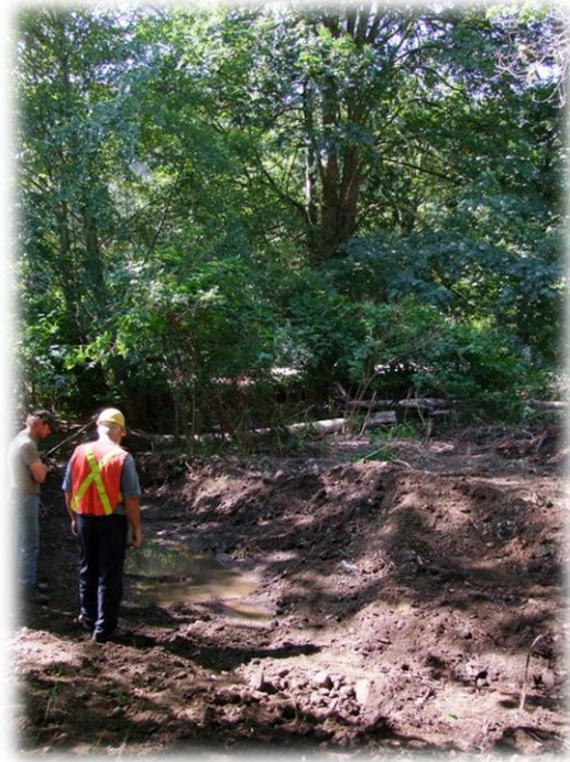
Ground water seepage is filling up the new pond.

Metro Vancouver Parks provided and installed the signage and temporary fencing.