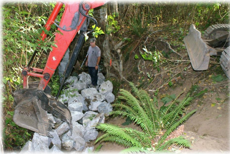
The rock was obtained locally on Bowen Island from the J & E Backhoe "Pit"