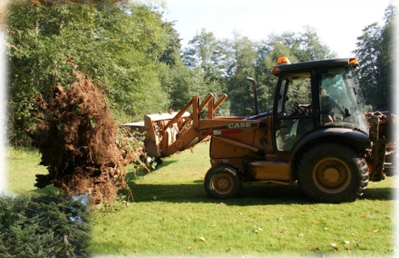
The windfalls were handed over from the excavator to the backhoe for transportation to the creek close to the ocean. Photo taken August 2009.